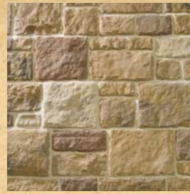
Diamond Back Chalk