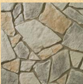
Marble Falls Fieldstone