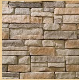
Marble Falls Drystack