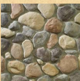
Clear Creek River Rock