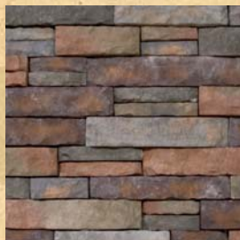
New Haven Ledgerstone