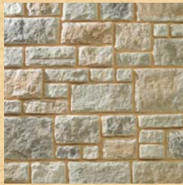
Marble Falls Chalk