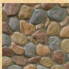
St. Croix River Rock