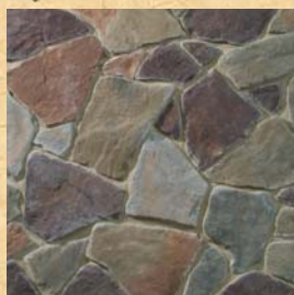
New Haven Fieldstone