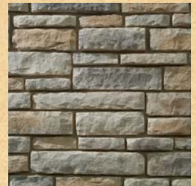
Marble Falls Ledgerstone