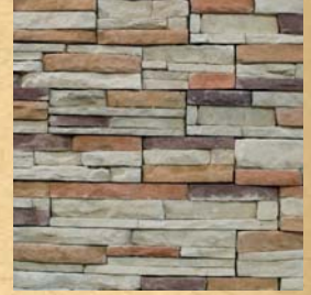
Rocky Mountain Stackstone