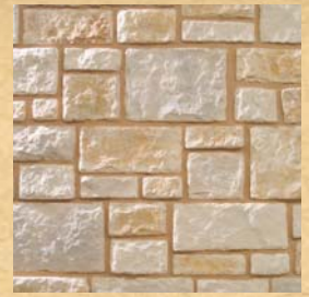
Hill Country Chalk