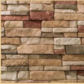
Bryce Canyon Drystack