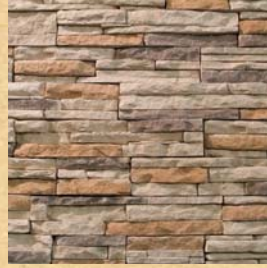
Marble Falls Stackstone