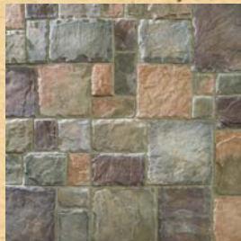
New Haven Castlestone