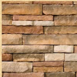
Chippewa Falls Ledgerstone