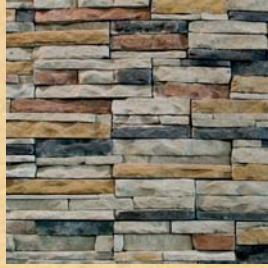
Grand Canyon Stackstone